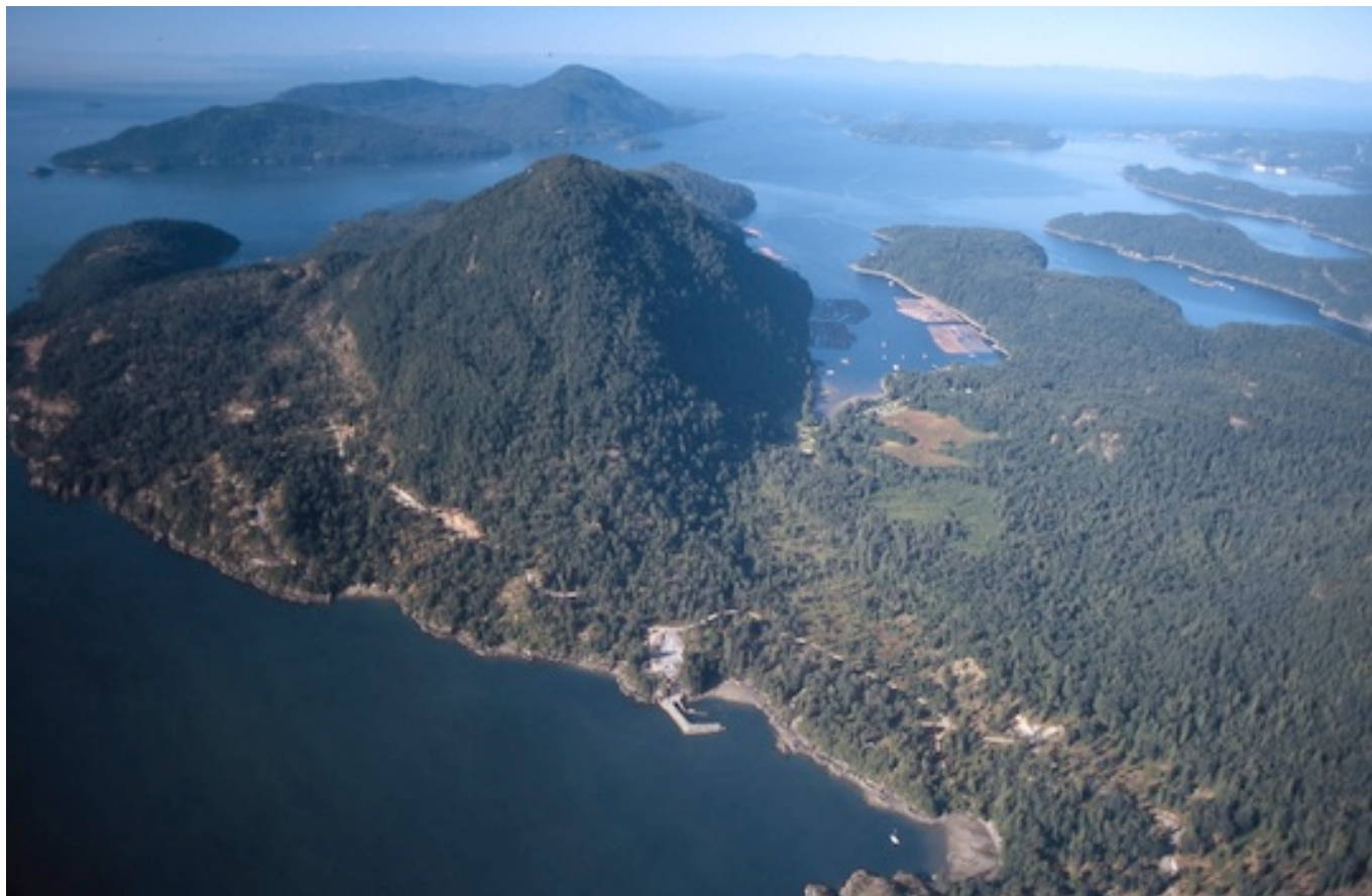
Aerial view of Texada Island.